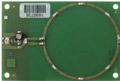
External Antenna ID ISC.ANT.U75/50-x