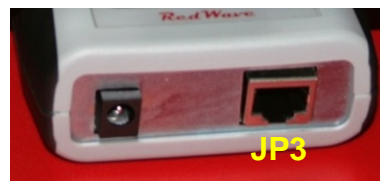
Wi-Fi & Mobile GPRS versions