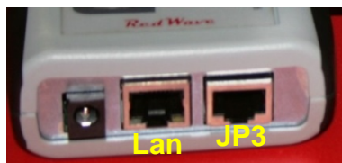
Lan Ethernet version