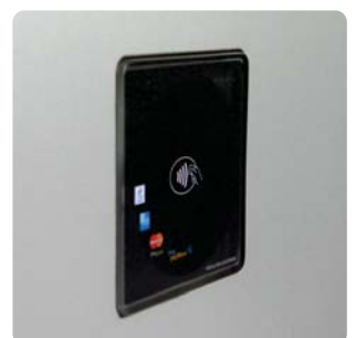
Flush mounting into terminals