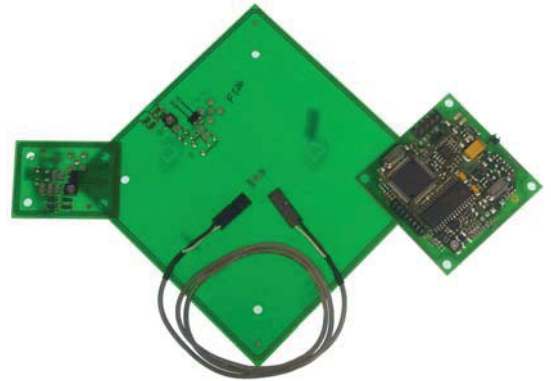
As external antennas, two 50Ω antennas ID ISC.ANT40/30 and ID ISC.ANT100/100 are available.

FEIG ELECTRONIC reserves the right to change specification without notice at any time. Stand of information: August 2011.