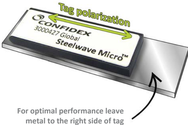
For optimal performance leave metal to the right side of tag

When mounting the tag with its adhesive background, clean and dry the surface for obtaining the maximum bond strength. Ideal application temperature is from +21°C to +38°C (+70°F to +100°F), bond strength can be improved with firm application pressure and moderate heating from +38°C to +54°C (+100°F to +130°F). Installation at temperatures below 10°C (50°F) is not recommended.