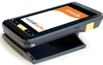
NORDIC ID MEDEA UHF RFID CROSS DIPOLE