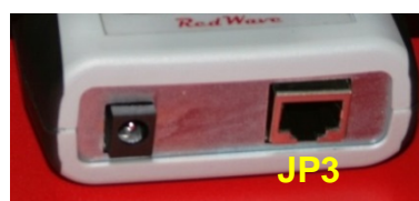
Wi-Fi & Mobile GPRS versions