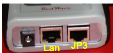
Lan Ethernet version